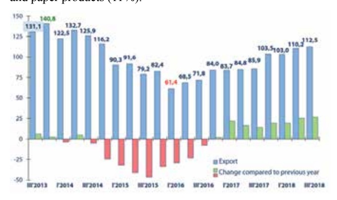
Figure 1. Dynamics of Russian exports, billion dollars<sup>1</sup>

The current state of the export activities of the Russian Federation is characterized by a high share of commodity exports. which is about two-thirds of the total exports. Russia's exports for three quarters of 2018, according to the Russian Federal Customs Service, amounted to $325.6 billion (Figure 1), non-energy exports increased to $105.3 billion according to the REC's estimates. The growth of total exports compared to 3 quarters of 2017 was 28% (+71.3 billion dollars), the growth of non-energy exports was 16.5% (+$14.9 billion). Positive dynamics of total exports and for non-energy exports are recorded for the eight hand the ninth quarter in a row. At the same time, the quarterly growth rate of total exports for seven quarters does not fall below 20%. The main contribution to the increase in total exports was made by fuel (77% of cumulative growth) and metals (10%). In non-energy exports the main contributors in growth were metal products (44%), food (23%), chemical products (15%) and wood and paper products (11%).